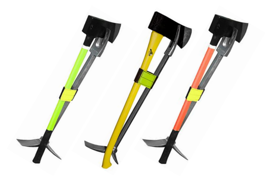
Ultra-Force Axe with Leatherhead-Lock